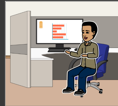
Student starts work in their new job