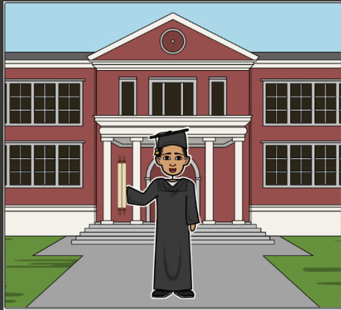
Student graduates high school