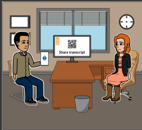
Student arrives for their induction with their new employer