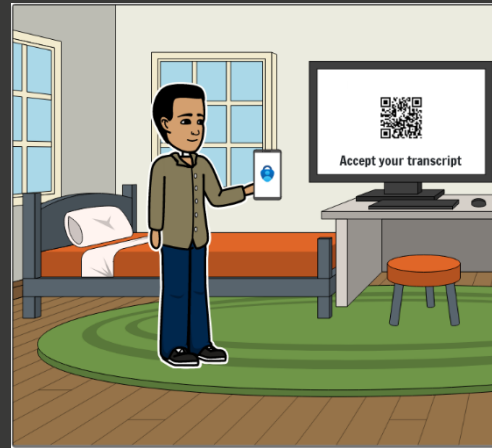
Student receives their digital transcript